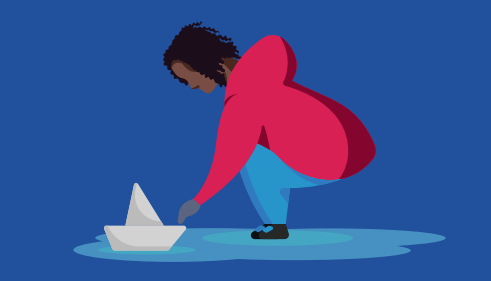
Over 40% of Black children in the County live in poverty, a rate over ten times higher the rate of poverty for white children. -Alameda County Public Health Department, 2019

County parents/caregivers shared that only 33% of County children were fully ready for kindergarten in 2021-2022 compared to 44% in 2019.